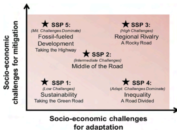
Fig. 1. Five shared socioeconomic pathways (SSPs) representing different combinations of challenges to mitigation and to adaptation. Based on Fig. 1 from O'Neill et al. (2014), but with the addition of specific SSPs.

Social, economic, and technological trends continue much as before, but not fast enough to stave off some degradation to environmental systems. Fossil fuel dependency declines slowly, though unconventional fossil resources are still exploited.